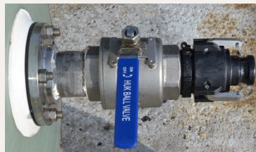
3 inch valve and 2 inch reducer